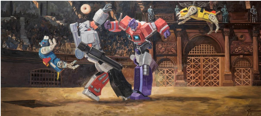
Eric Joyner – 'MELEE' oil on panel, 81" x 36.25"

EXHIBITION OPENS SATURDAY, FEBRUARY 20 AND MARKS JOYNER'S FOURTH SHOWING AT CHG AND FIRST IN THE GALLERY'S NEW EXPANSIVE DOWNTOWN LOS ANGELES 12,000 SQUARE FOOT SPACE